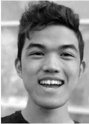
Senwin Pareja Male Ensemble Swing: Male Kids Theatre Minor, Junior