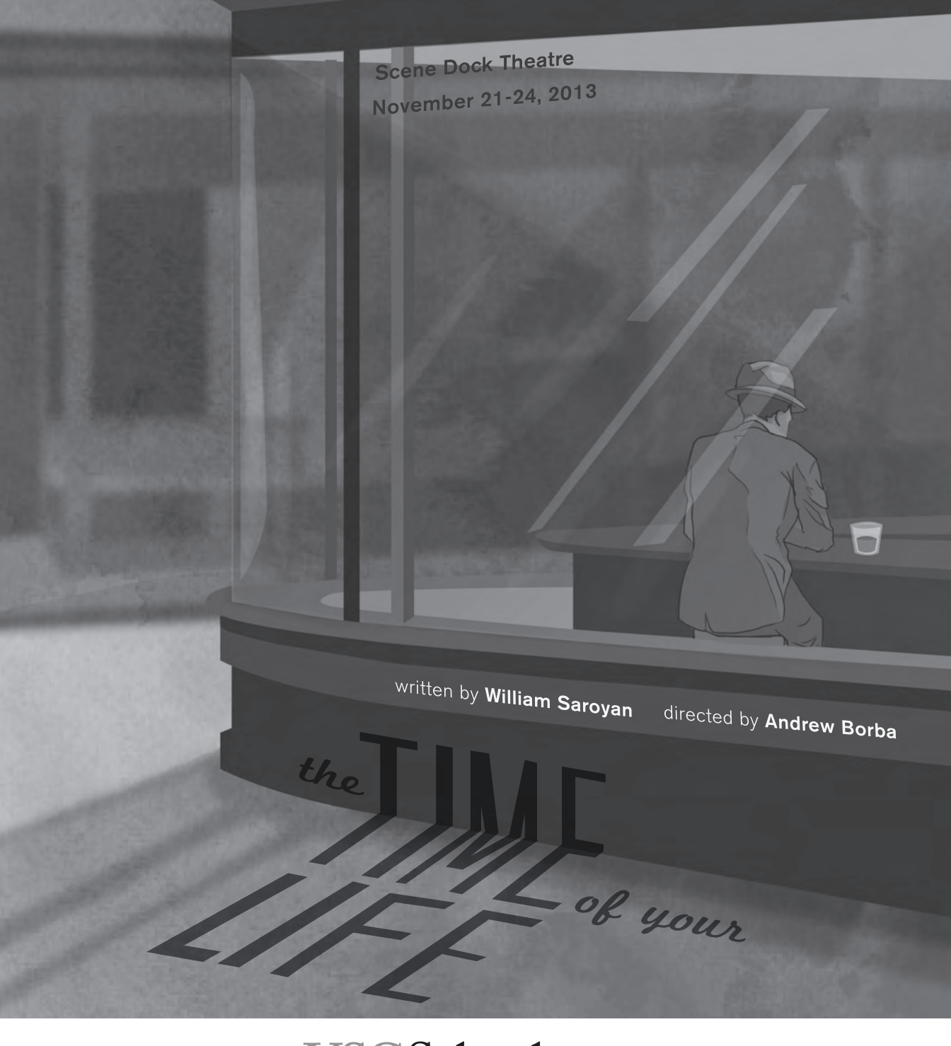
USC School of Dramatic Arts